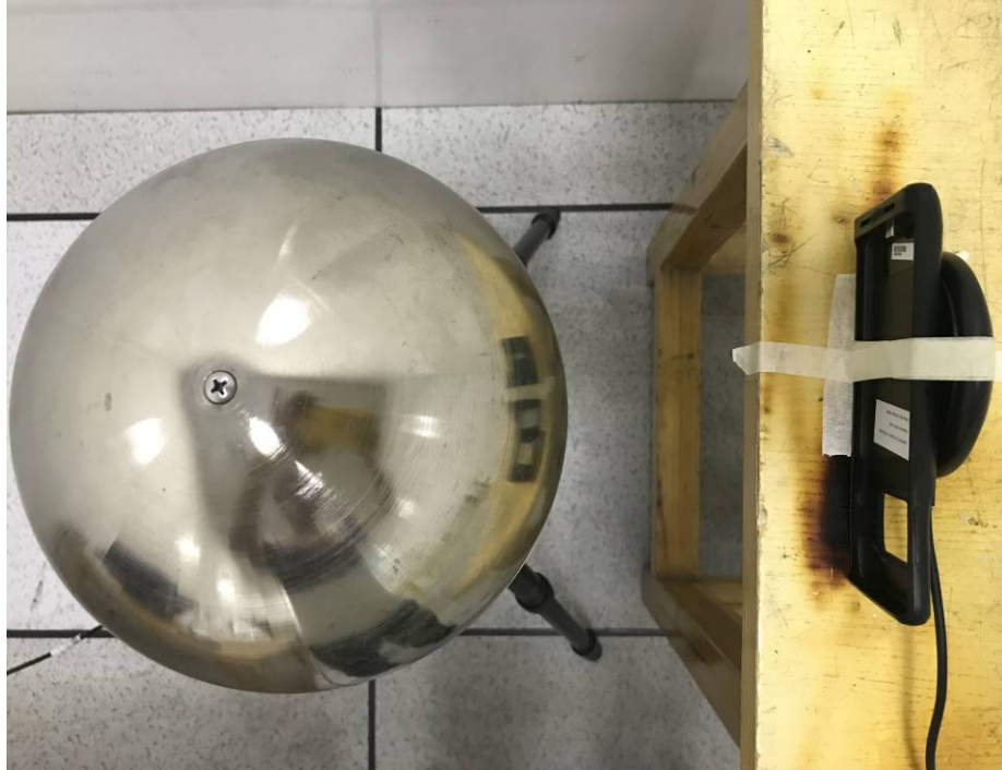
Bottom Side(measurement distance of 15cm)