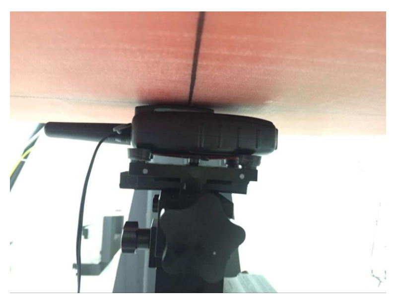
Body-worn, the rear of the EUT towards ground with A1, B1, BC1 and AC1