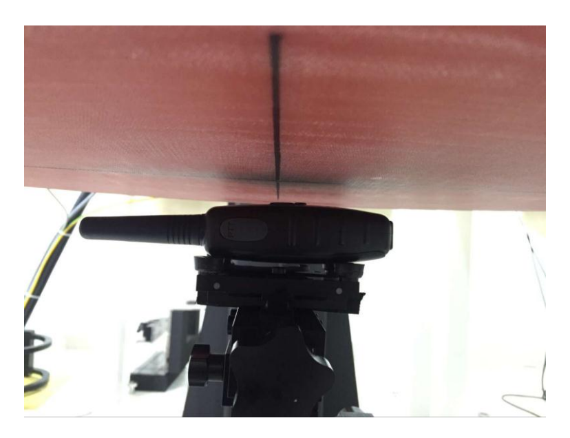
Face-held, the front of the EUT towards phantom