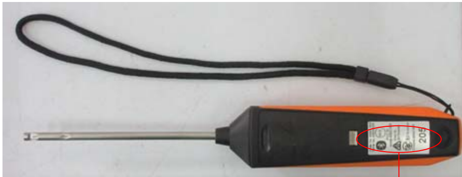
FCC ID & IC Label Location