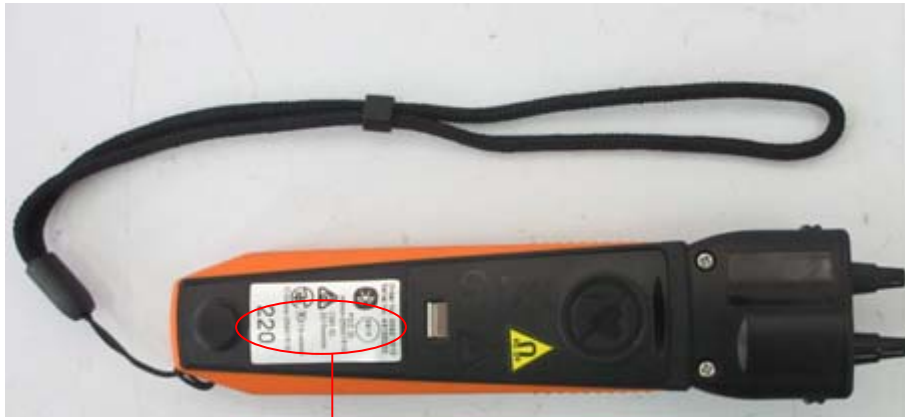
FCC ID & IC Label Location