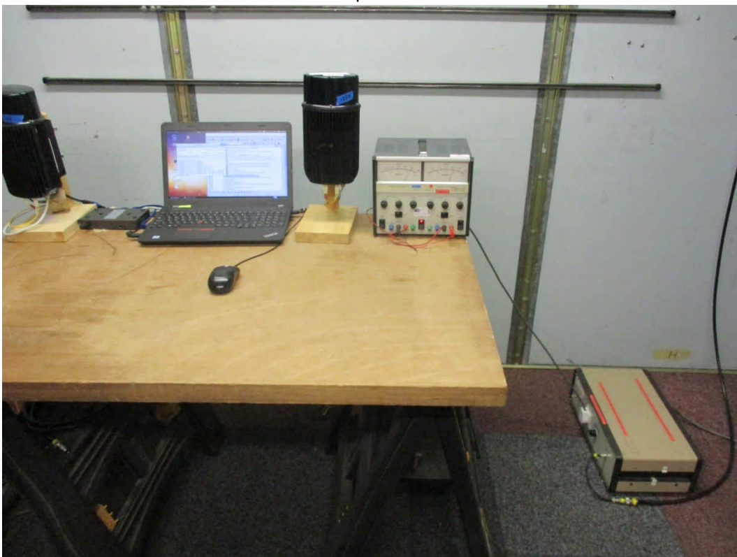
DC PSU powered