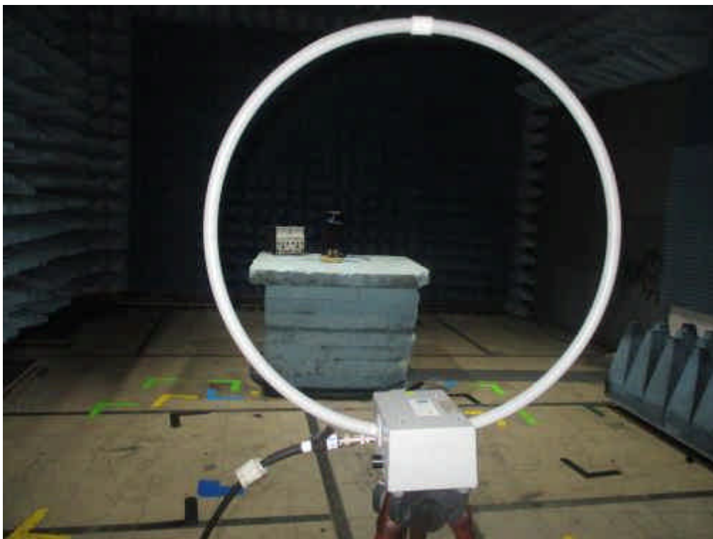
DC PSU powered