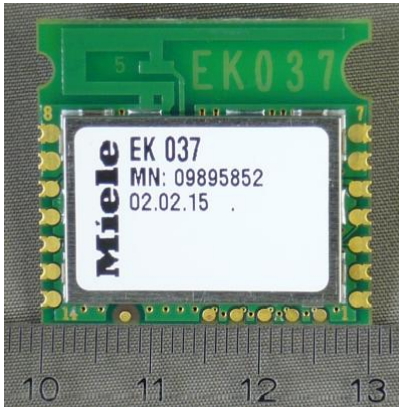
145729_10.JPG: EUT - top view, with shielding