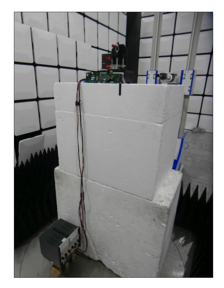
Figure 3 - Test Setup - 18 GHz to 25 GHz