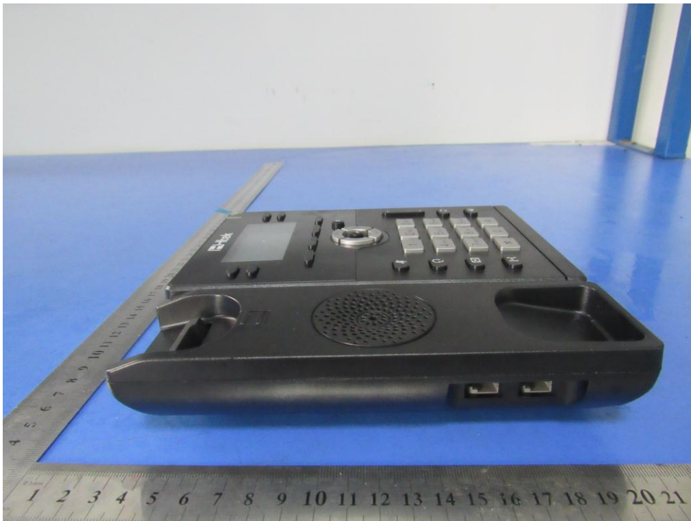
Left View of EUT