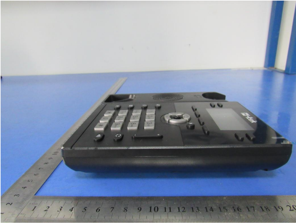
Right View of EUT