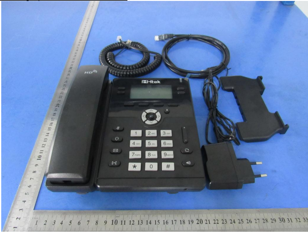
The Whole Package – Front View