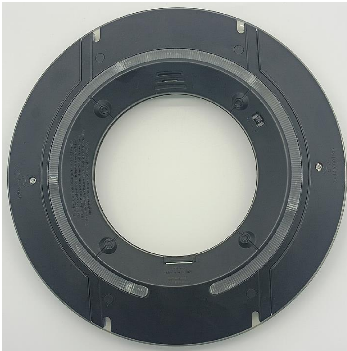
TLG21 ID DISC W SPKR - Product photo: