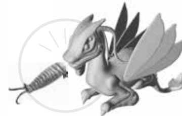
Hold Teylu next to Banshee's head to activate movement/sounds and communicate with nearby Banshee's.