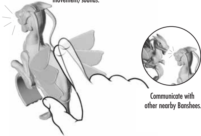
Communicate with other nearby Banshees.

Tap finger on Banshee's back 1x, 3x, or 5x times to activate movement/sounds.