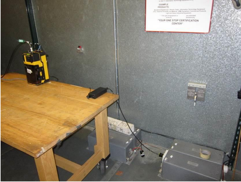
Figure 8 Test Setup for Frequency Stability