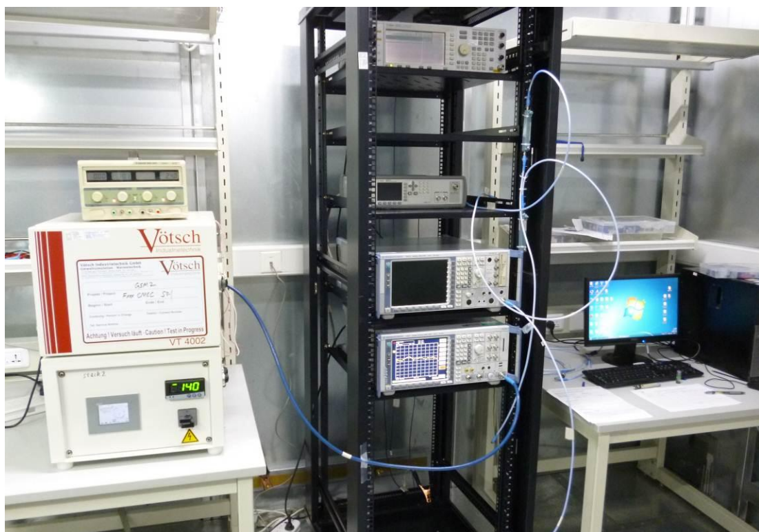
Photograph 3: Set-up for Fundamental emission bandwidth and Frequency stability test

Note: The antenna will change according to different frequency band, and for 90-110GHz the distance was 0.01m