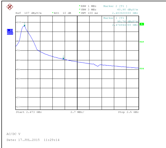
Upper edge (Peak measurement)