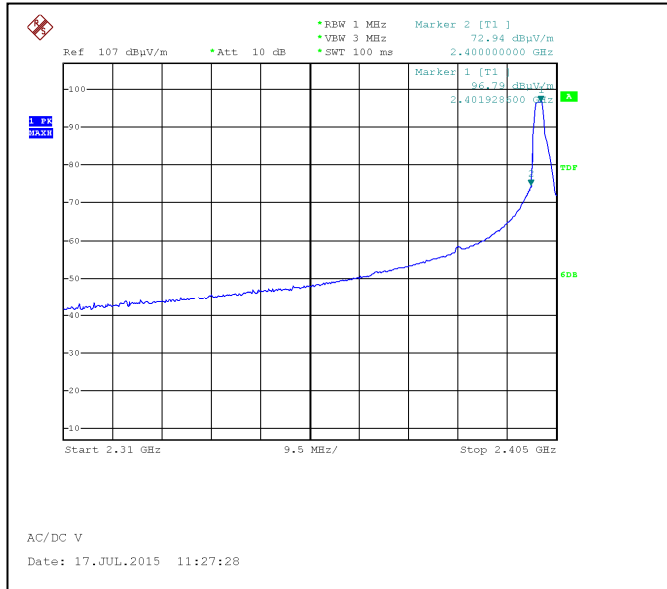
Lower edge (Peak measurement)