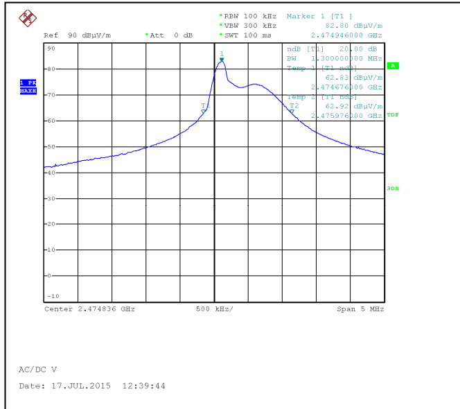
Bandwidth 3 (2475MHz)