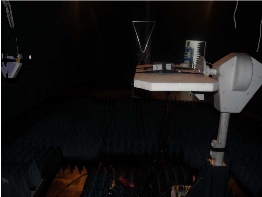
Photo 4: Test setup for radiated measurements, EUT in horizontal position Enclosure, fully-equipped anechoic chamber, 18-25 GHz. §15