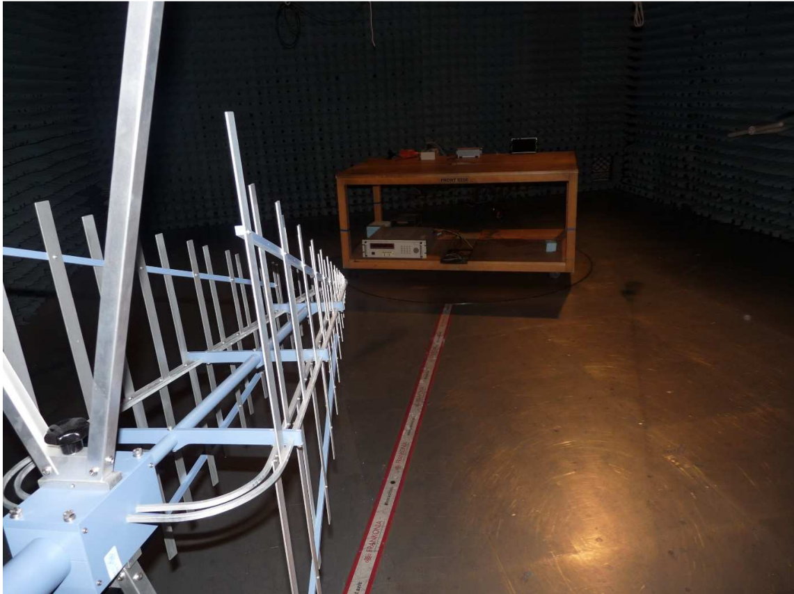
Photo 2: Test setup for radiated measurements, EUT in vertical position Enclosure, semi-anechoic chamber, 30 MHz to 1 GHz, intentional radiator §15