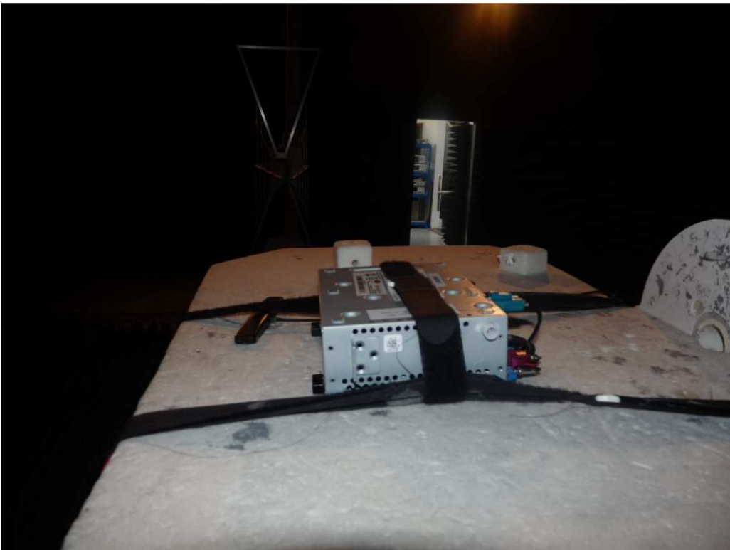
Photo 3: Test setup for radiated measurements, EUT in horizontal position Enclosure, fully-equipped anechoic chamber, 1-18 GHz §15