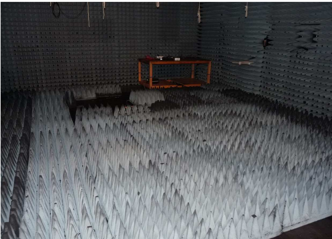
Photo 1: Test setup for radiated measurements, EUT in horizontal position Enclosure, semi-anechoic chamber, below 30 MHz, intentional radiator §15