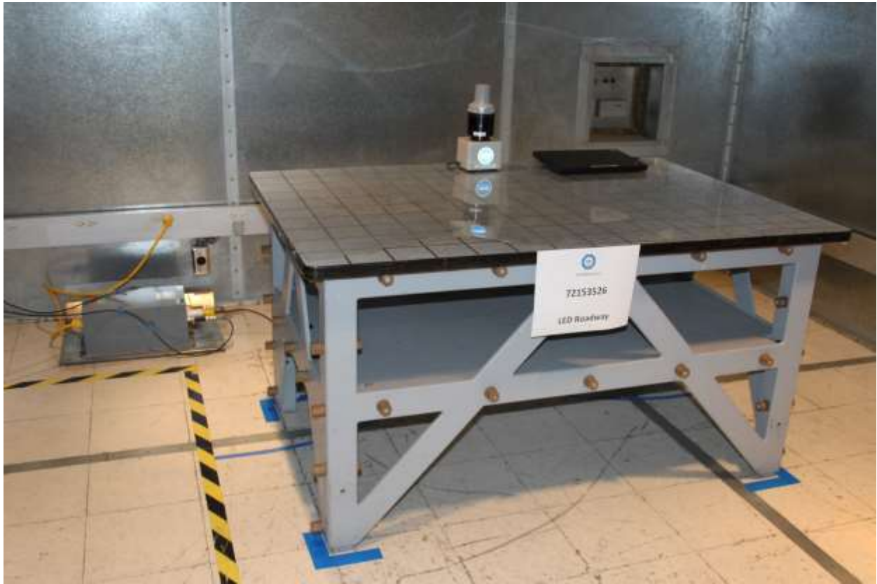
AC Conducted Emissions Test Setup