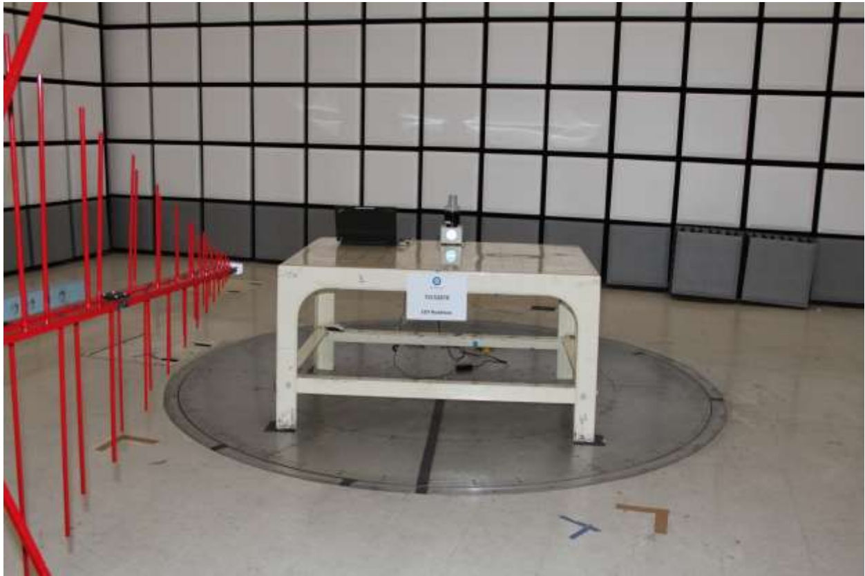
Radiated Emissions Test Setup (30MHz to 1GHz) including intermodulation verification