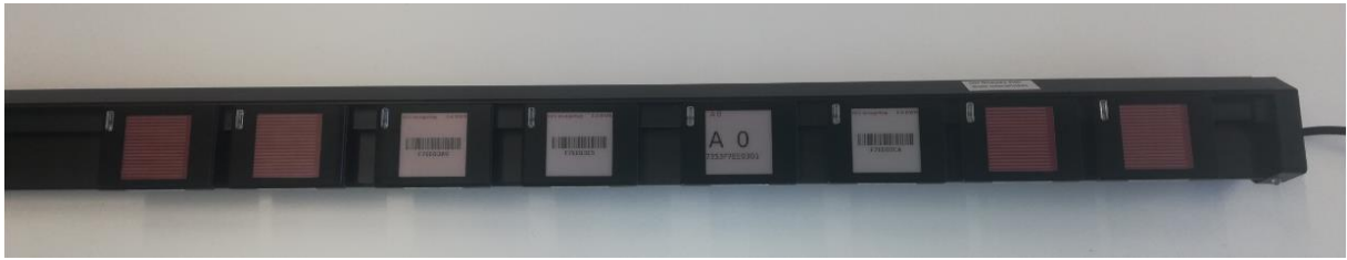
Figure 10 - Plugging Rail Displays into Rail