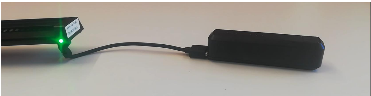
Figure 9 - After connecting, the LED of the Rail Controller flashes in green color