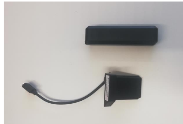
Figure 3 - Rail Controller & Rechargeable Battery Pack