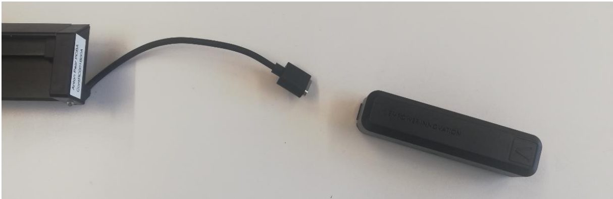
Figure 7 - Rail with Rail Controller and Rechargeable Battery Pack