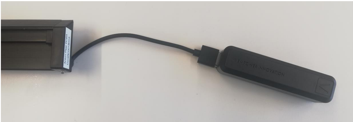
Figure 8 - Connect Rail with Rail Controller and Rechargeable Battery Pack