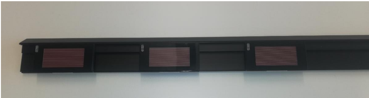
Figure 11 - Plugging Rail Displays into Rail