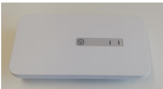
Figure 4 - BLE Access Point