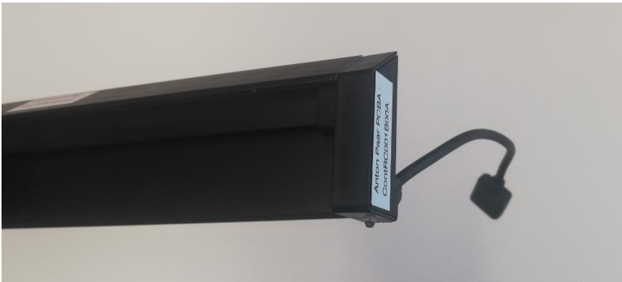
Figure 6 - Plugged Rail with Rail Controller