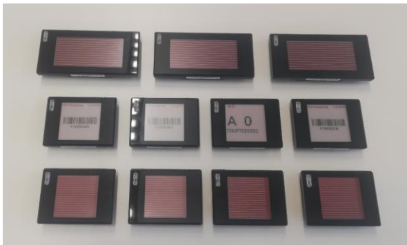
Figure 2 - Rail Displays