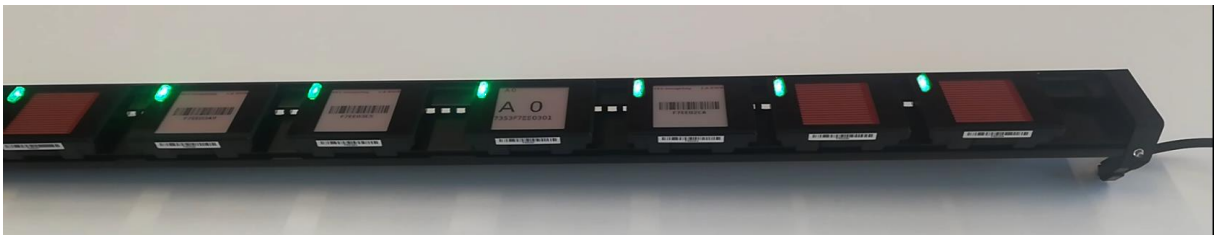
Figure 12 - LED of Rail Displays flashing green when a new Rail Display is plugged to the Rail