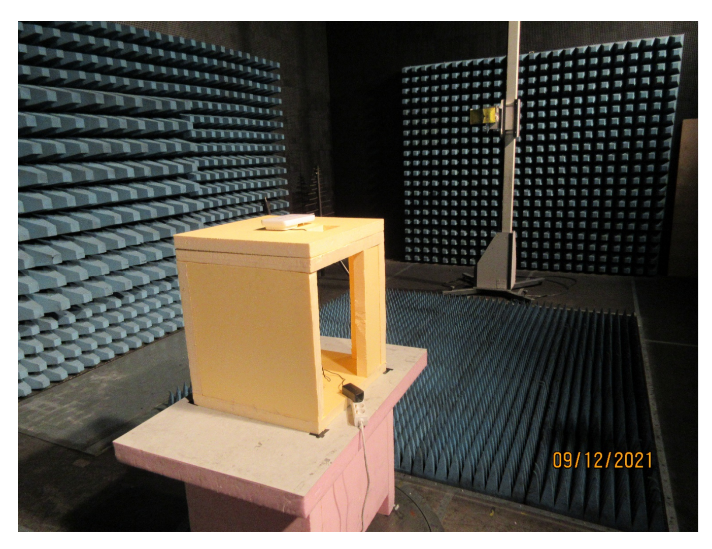
--- END OF TEST REPORT ---