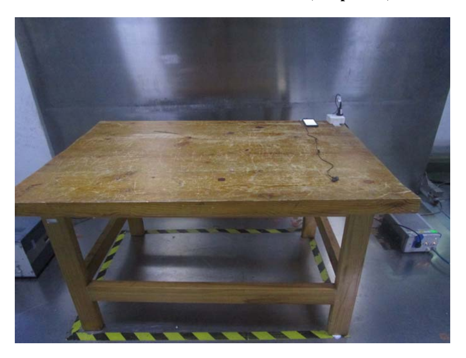
Conducted Emissions – Side View (Adapter #1)

Conducted Emissions – Front View (Adapter #1)