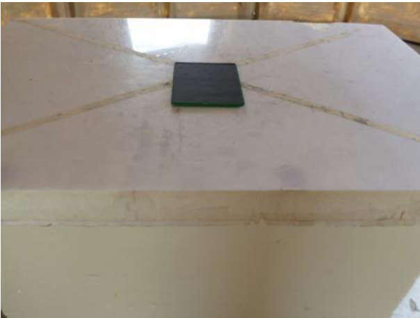
Test setup on OATS (Bluetooth mode):