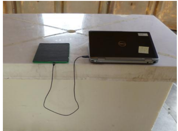
Test setup on OATS (USB mode):