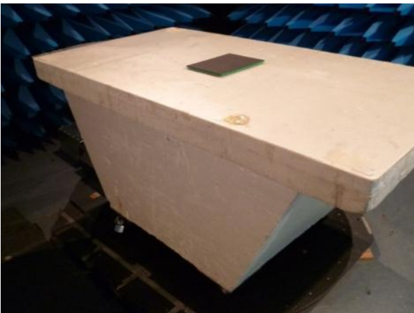
Test setup in anechoic chamber (Bluetooth mode):