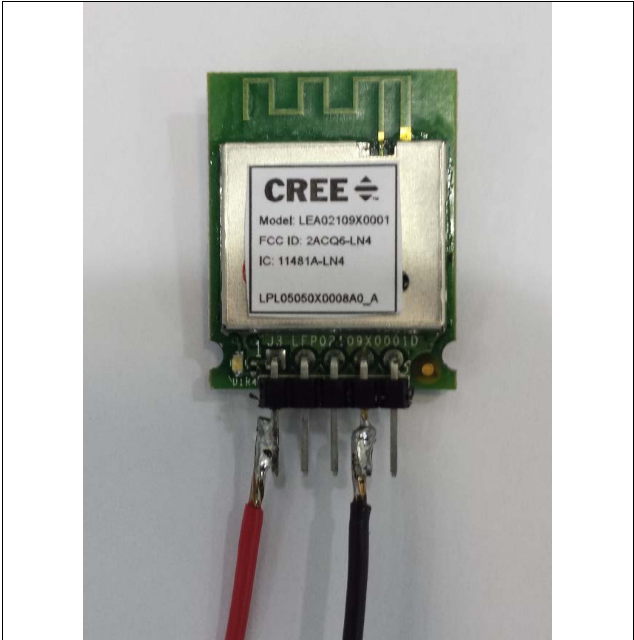
Top of Module