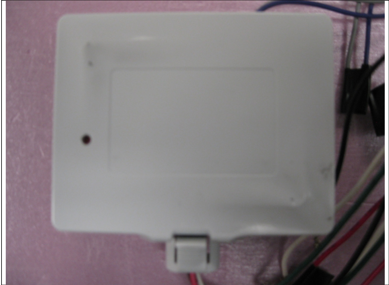
Bottom Side (CIF-10V-CWC-SNSR)