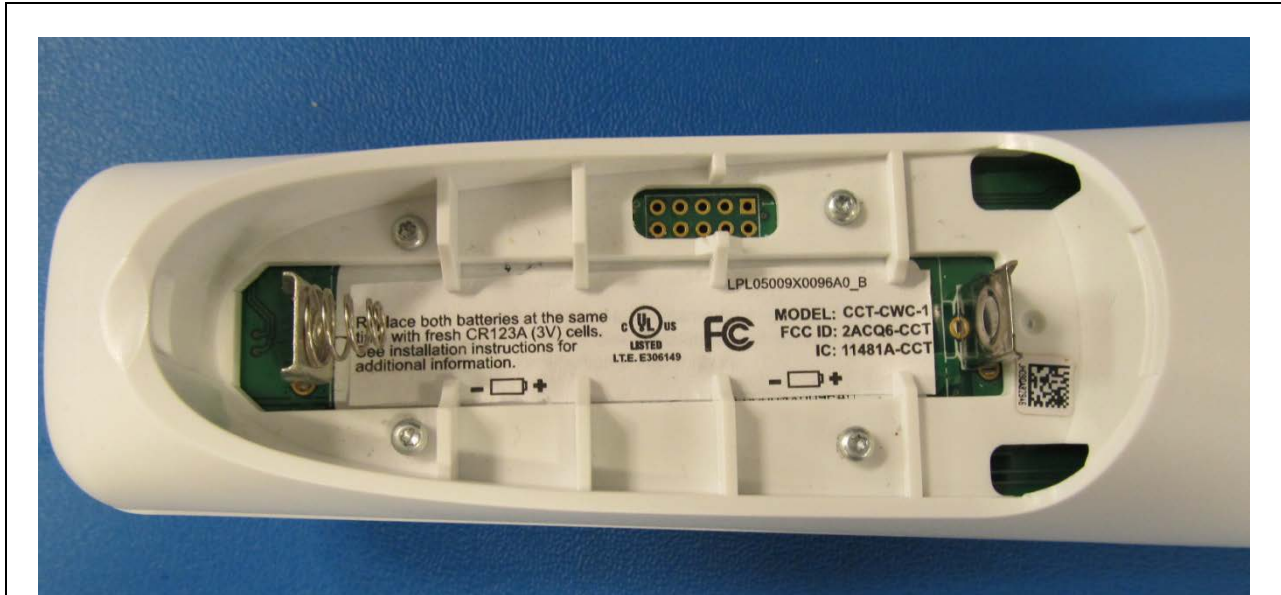
CT Tool (Inside Enclosure)