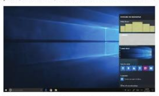
NOTE: If you don't have a Windows Ink pen, you may also draw using a mouse or finger.

Write sticky notes, make sketches, and draw on screenshots in Windows Ink Workspace.