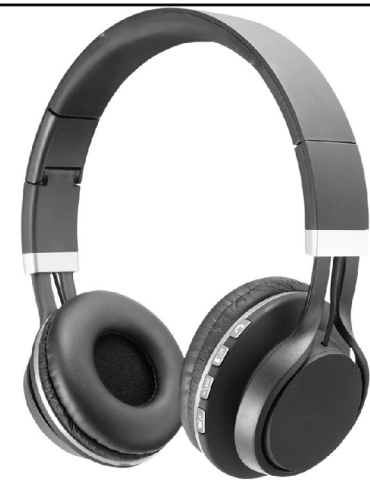
Bluetooth Headset FCC ID:2ACP4BT300