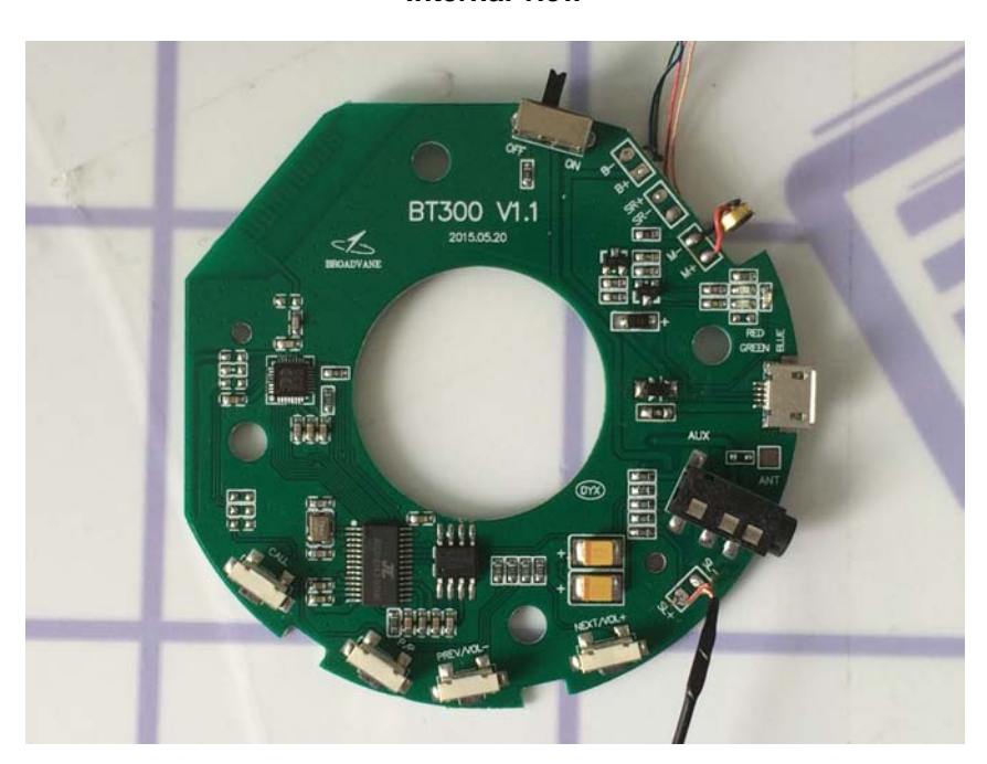
PCB side 1 view

Copyright of this report is owned by Centre of Testing Service and may not be reproduced other than in full except with the written approval of the issuing Company.