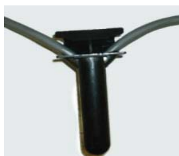
Figure 2 - A correct insertion of the splice in the burial pod.