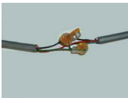
Figure 1 - A correct wire splicing using UY gel cap connectors.