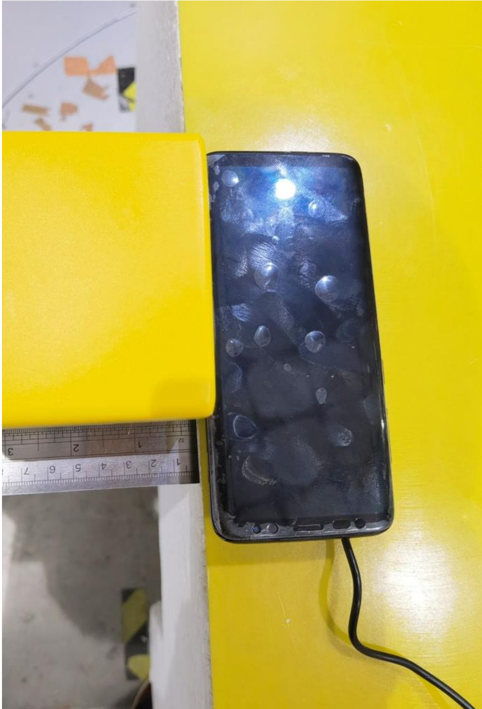
0cm side 1