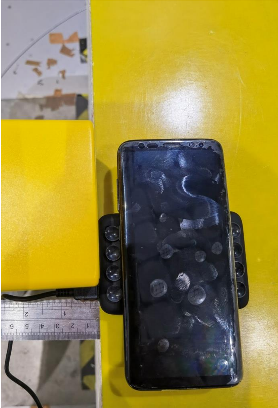
0cm side 4