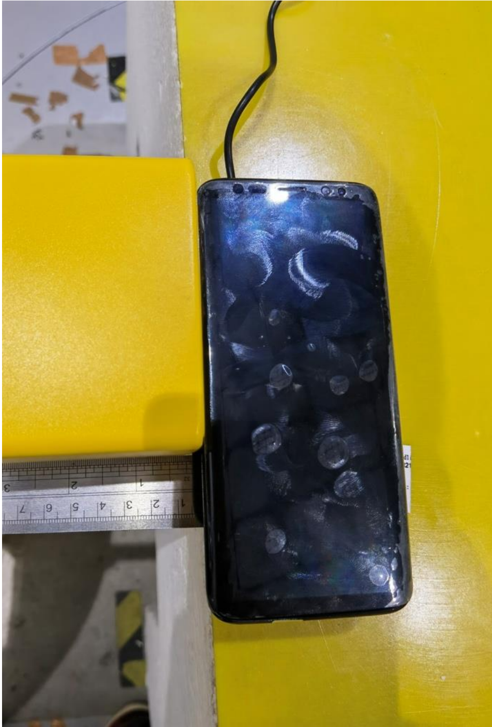
0cm side 2