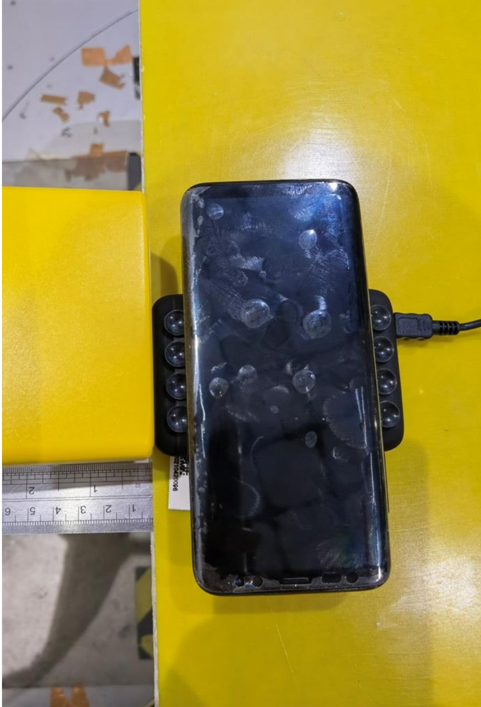
0cm side 3