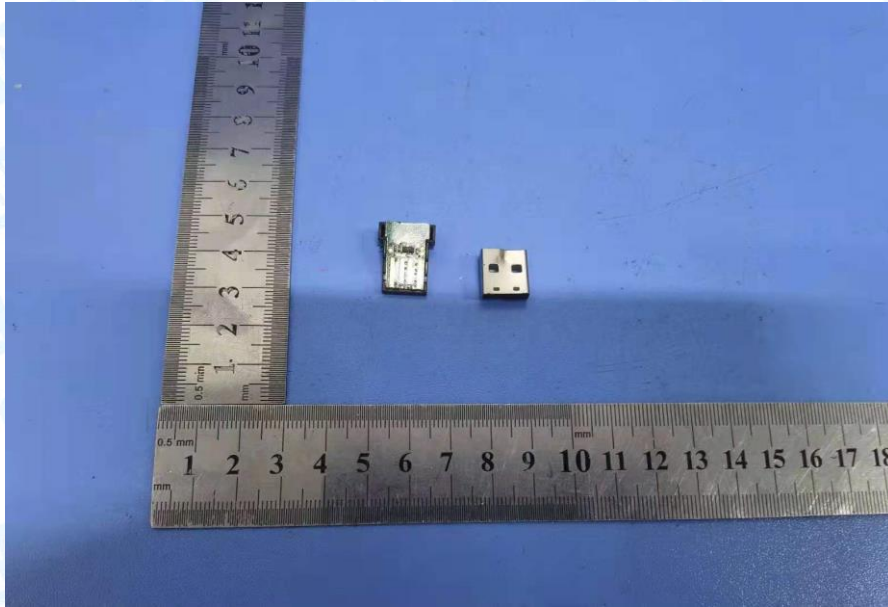
Photo 7 Internal of PCB