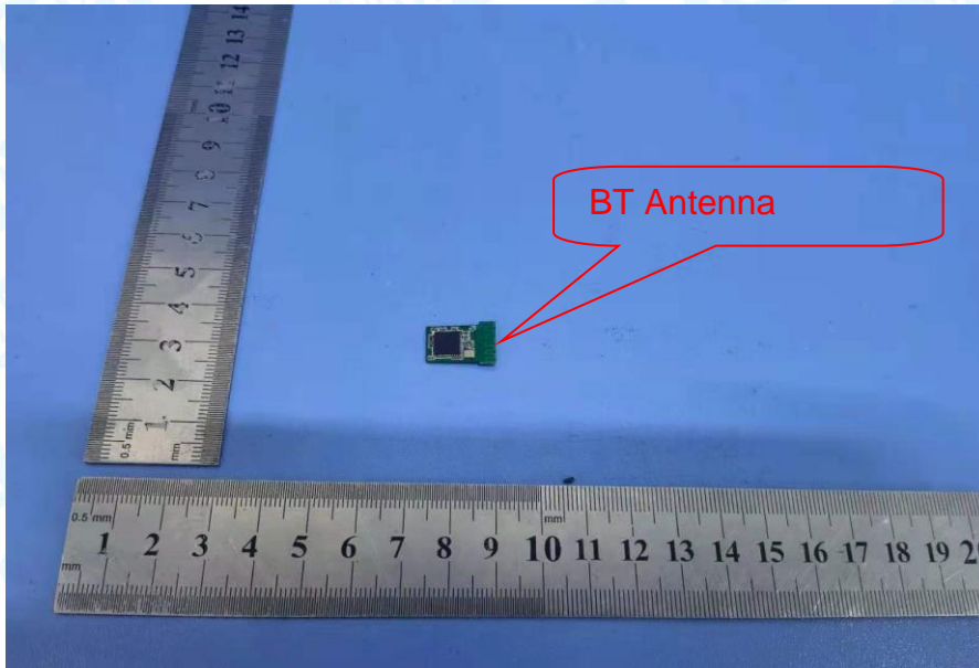
Photo 9 Internal of PCB