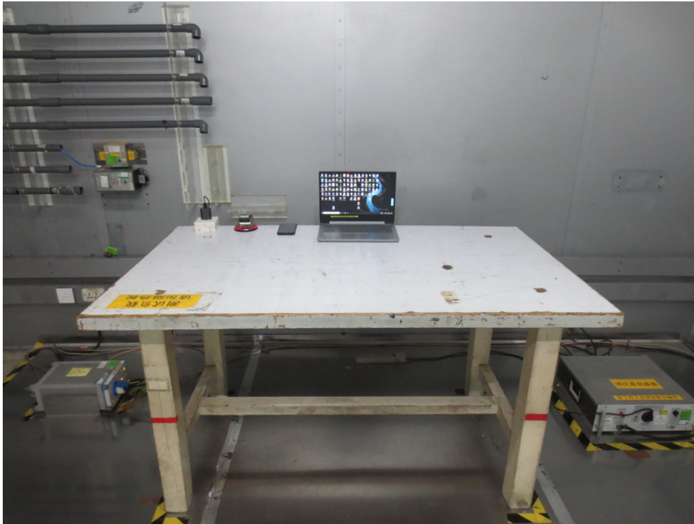
AC Power Line Conducted Emissions