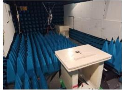
Axis XY on FAR ( under 1GHz)