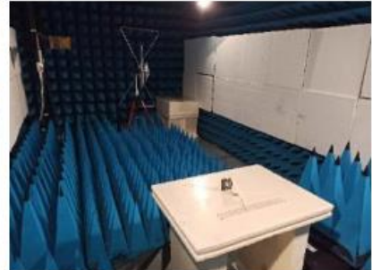
Axis XY on FAR ( under 1GHz)