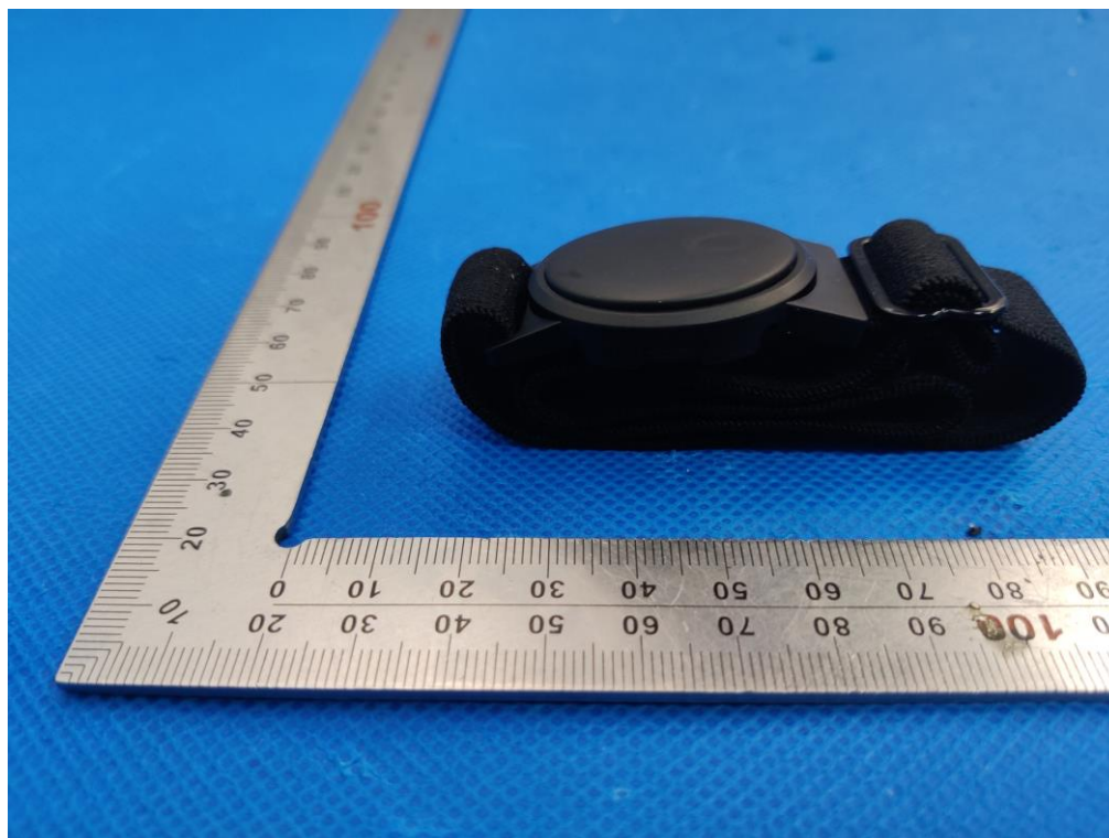
PORT VIEW OF EUT