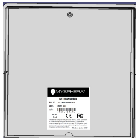
Illustration 2 – Identification in the device.