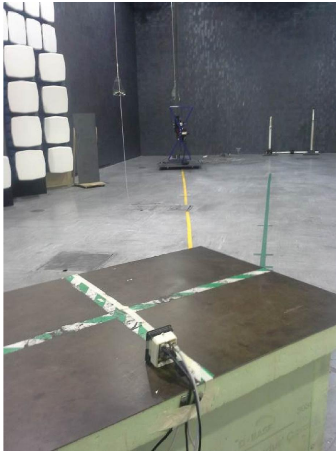
Radiated emission 30-1000 MHz