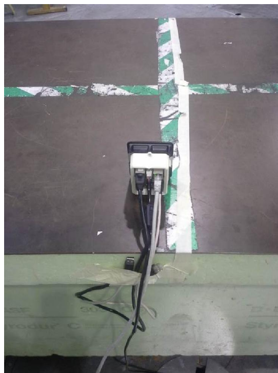
Radiated emission 30-1000 MHz