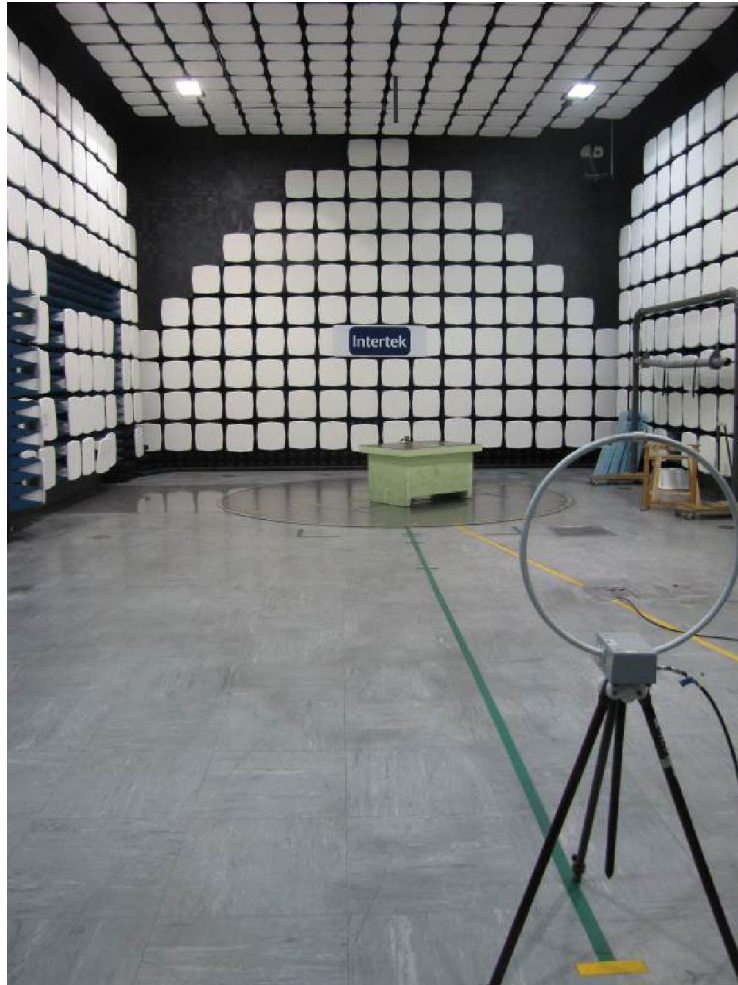
Radiated test below 30 MHz