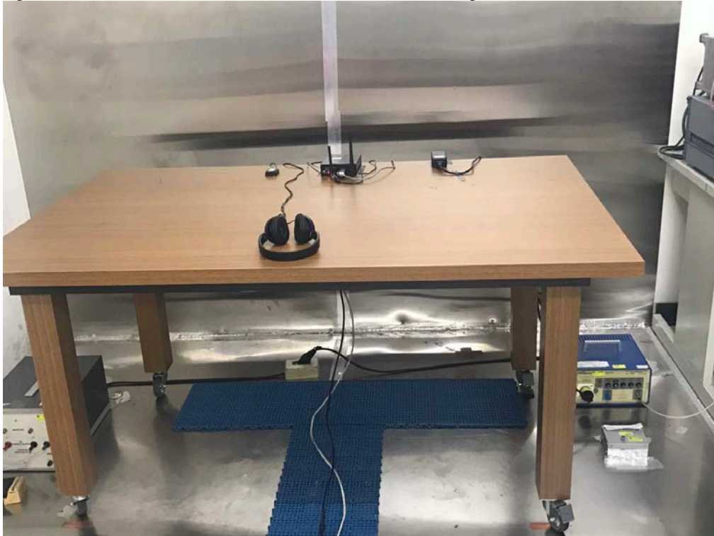
Photograph –Conduction Emission Test Setup