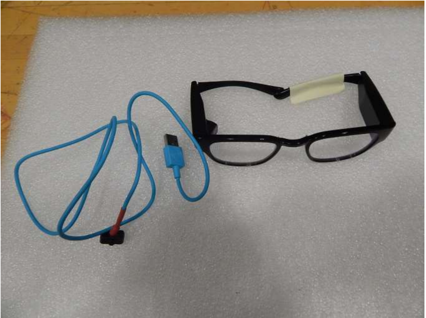
Figure 1.2-6: Programming cable view photo