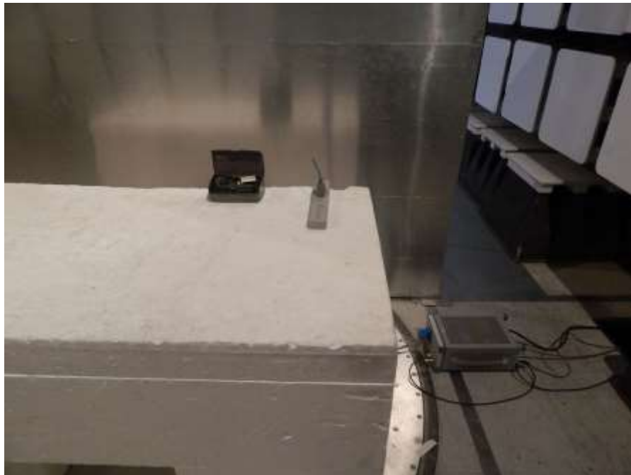
Figure 1.2-4: Conducted emissions – from AC mains power ports setup photo