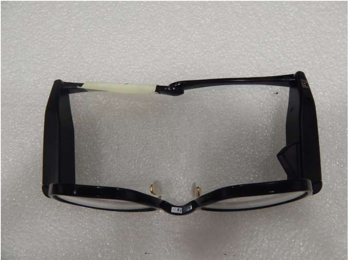
Figure 1.2-5: Top view photo