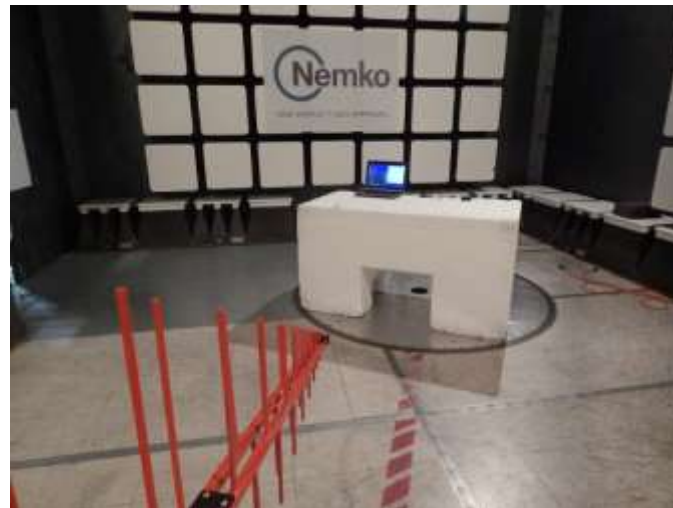
Figure 1.2-2: Radiated emissions setup photo – below 1 GHz