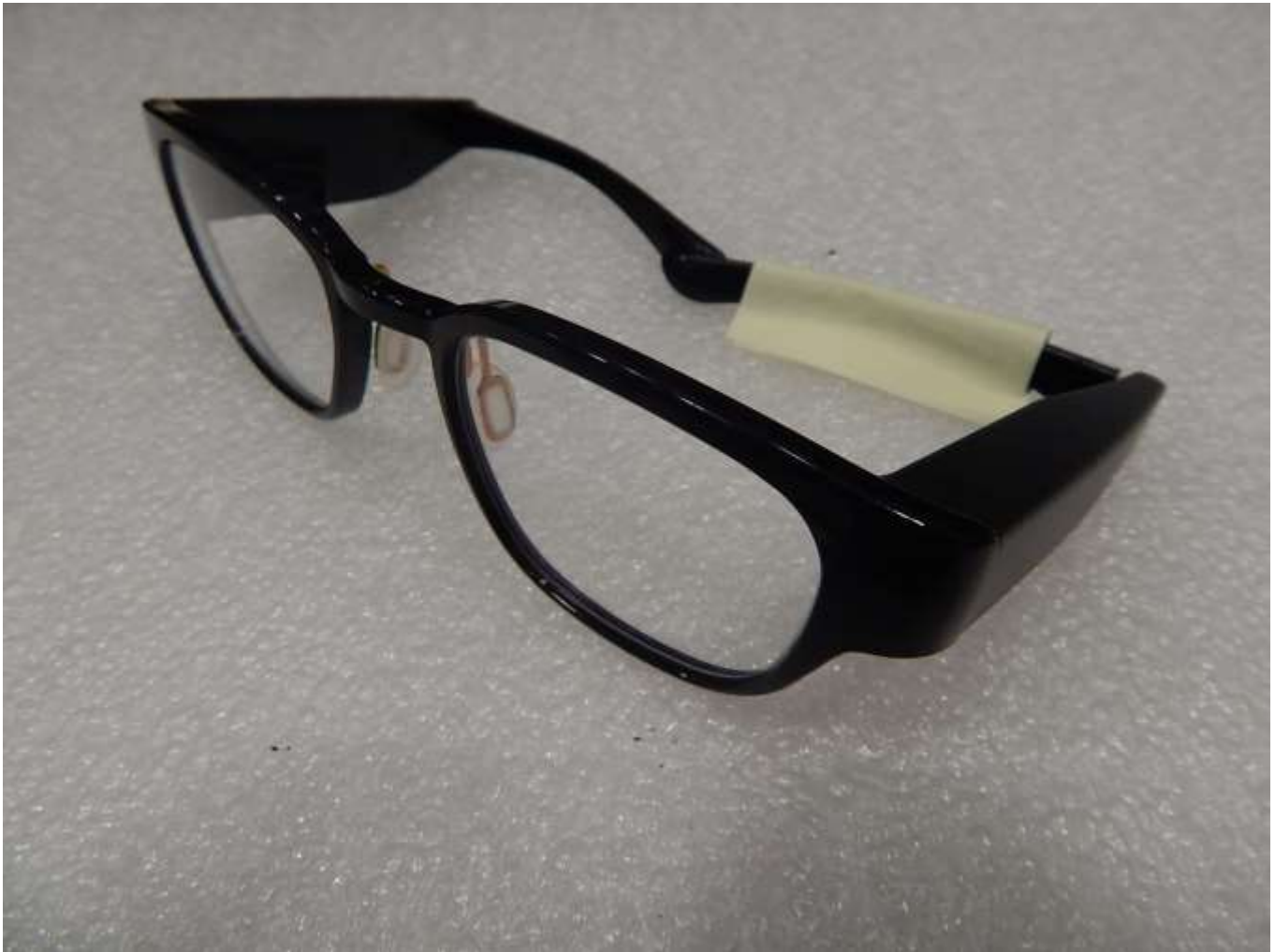
Figure 1.2-3: Side view photo