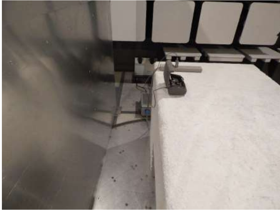
Figure 1.2-3: Conducted emissions – from AC mains power ports setup photo