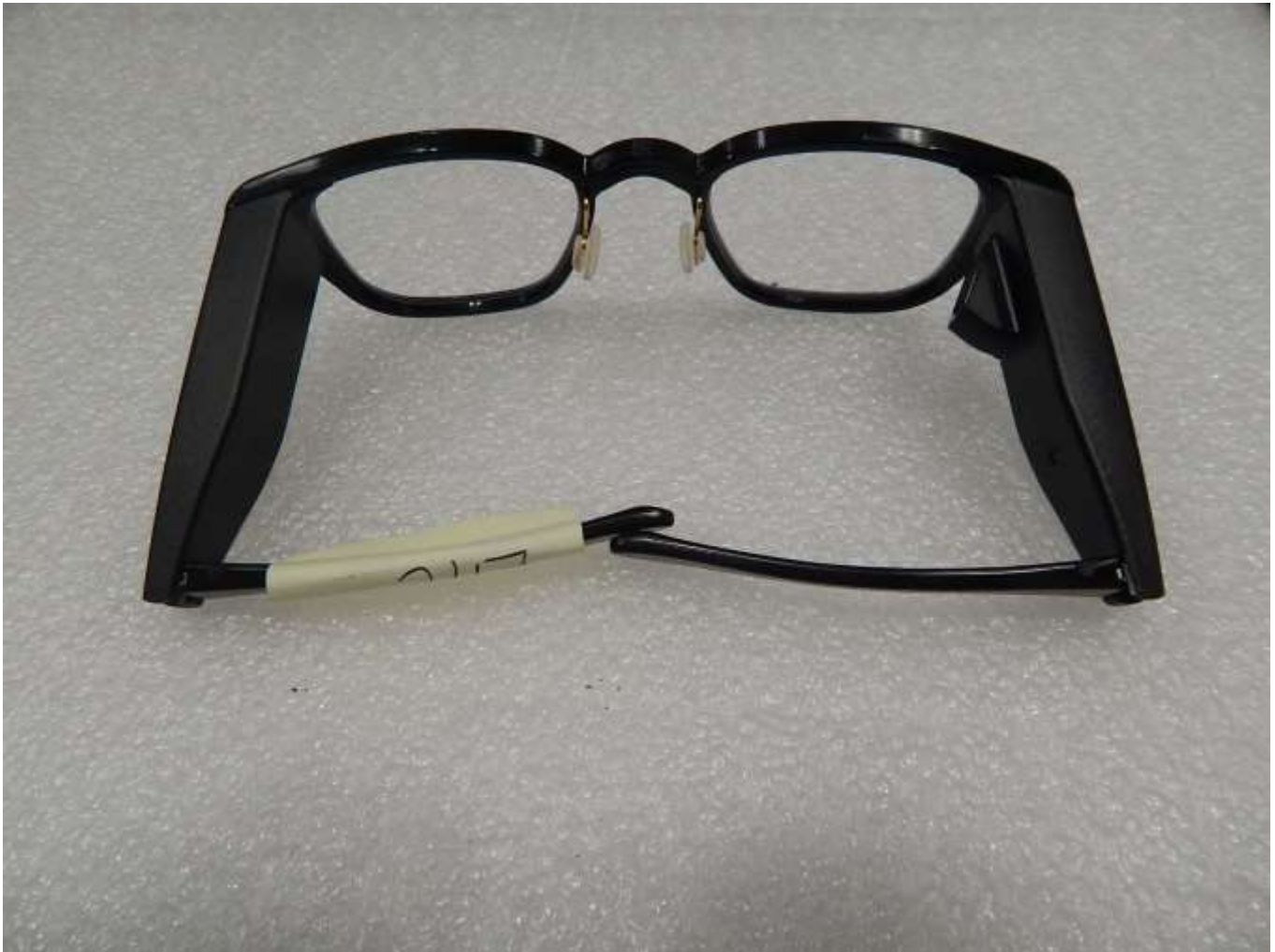
Figure 1.2-2: Rear view photo