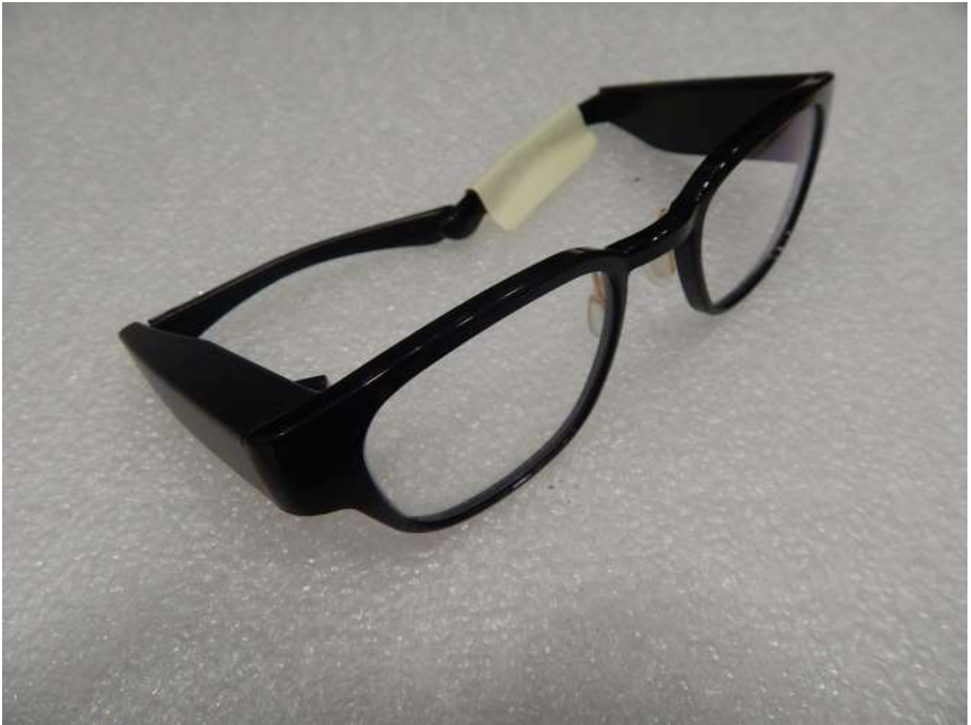
Figure 1.2-4: Side view photo