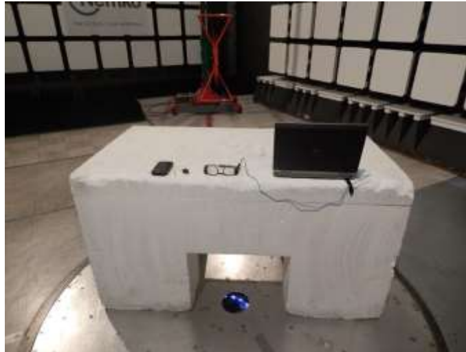
Figure 1.2-1: Radiated emissions setup photo – below 1 GHz