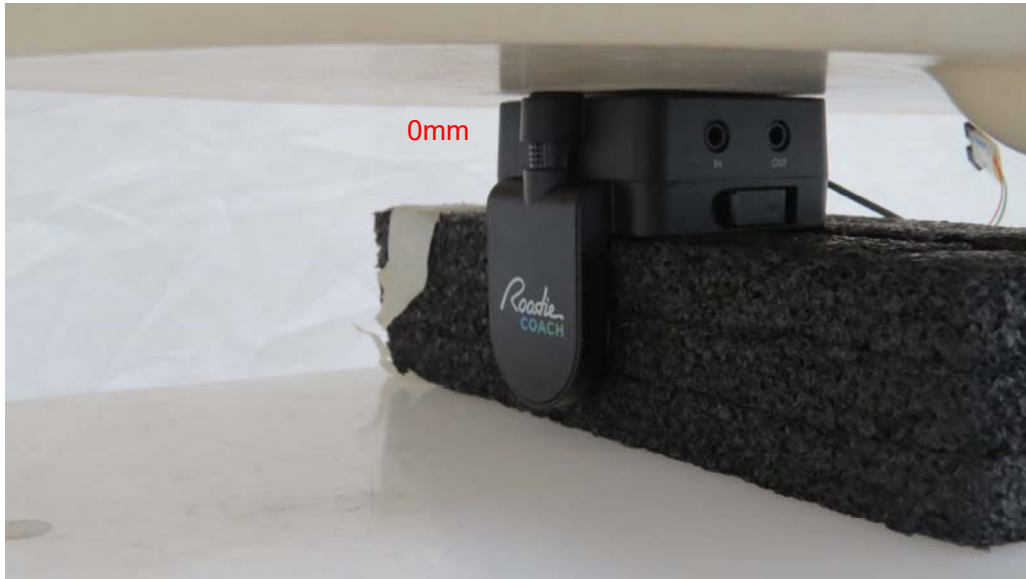
Picture 7: Back Side, the distance from handset to the bottom of the Phantom is 0mm