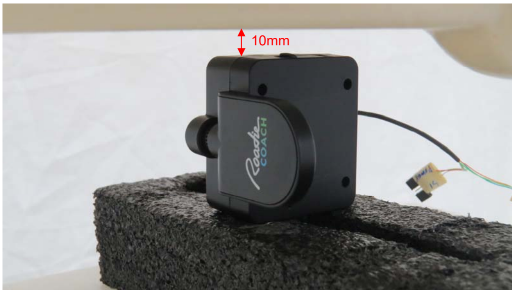
Picture 4: Right Edge, the distance from handset to the bottom of the Phantom is 10mm