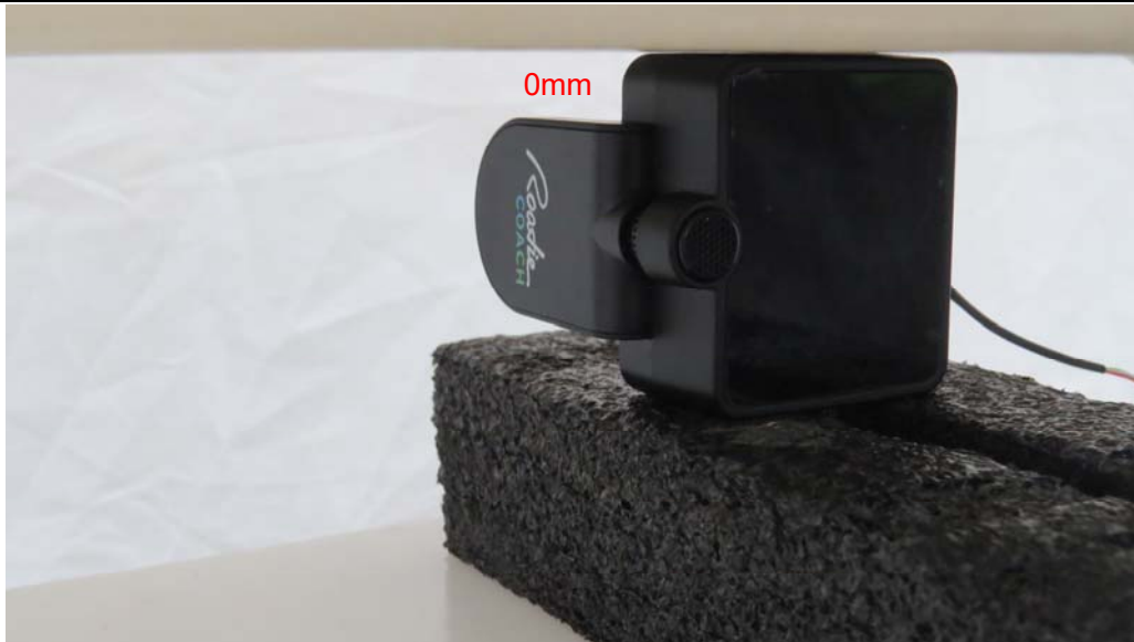
Picture 9: Left Edge, the distance from handset to the bottom of the Phantom is 0mm