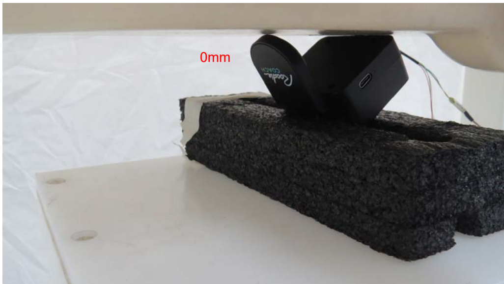
Picture 8: Front Side, the distance from handset to the bottom of the Phantom is 0mm