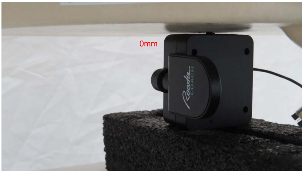
Picture 10: Right Edge, the distance from handset to the bottom of the Phantom is 0mm