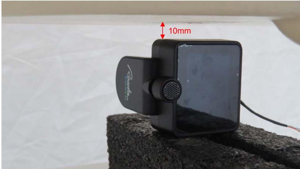
Picture 3: Left Edge, the distance from handset to the bottom of the Phantom is 10mm