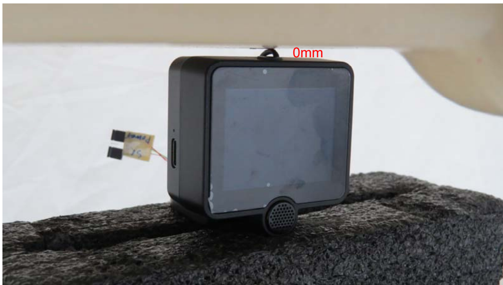
Picture 12: Bottom Edge, the distance from handset to the bottom of the Phantom is 0mm