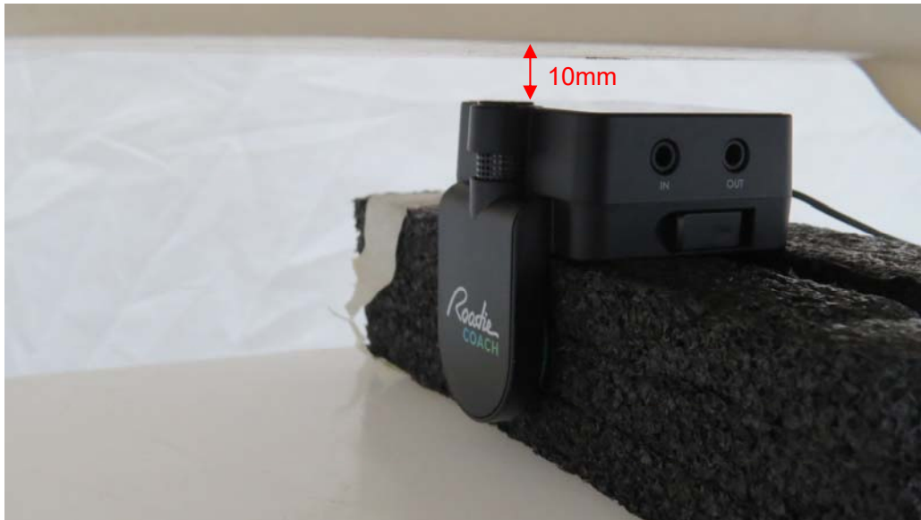
Picture 1: Back Side, the distance from handset to the bottom of the Phantom is 10mm