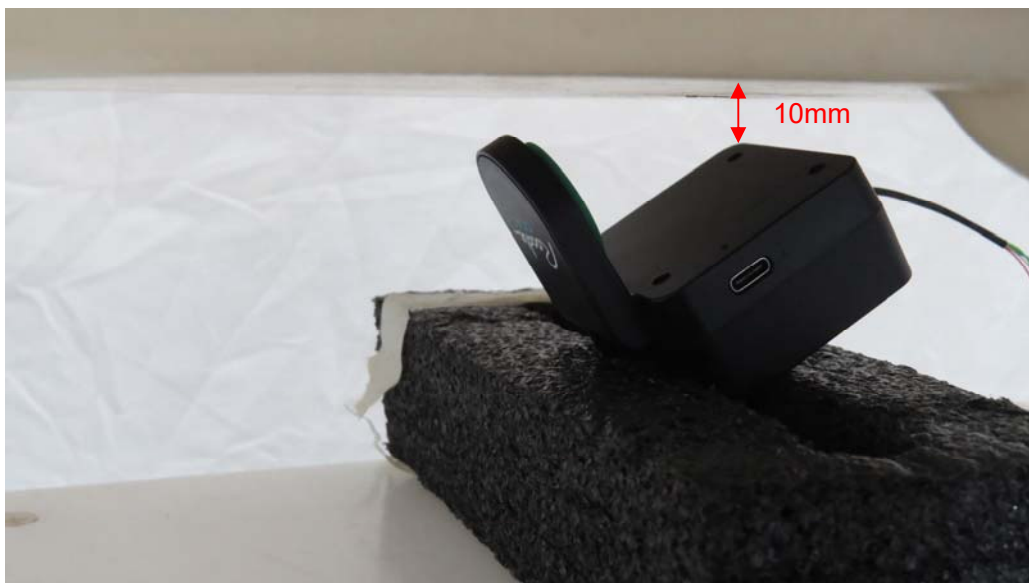
Picture 2: Front Side, the distance from handset to the bottom of the Phantom is 10mm