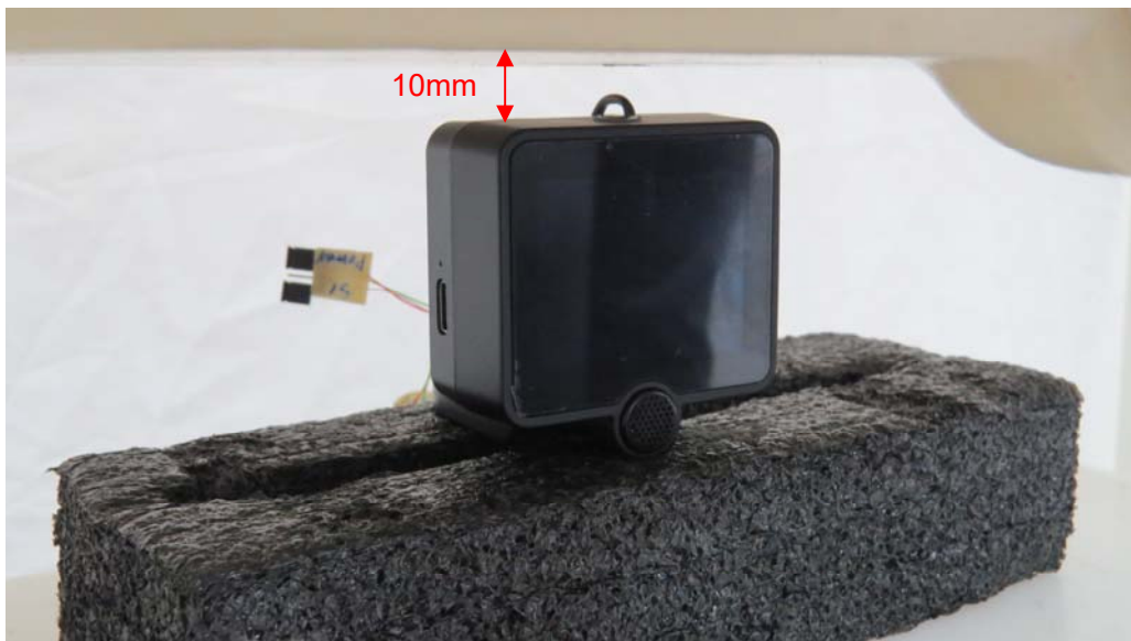
Picture 6: Bottom Edge, the distance from handset to the bottom of the Phantom is 10mm