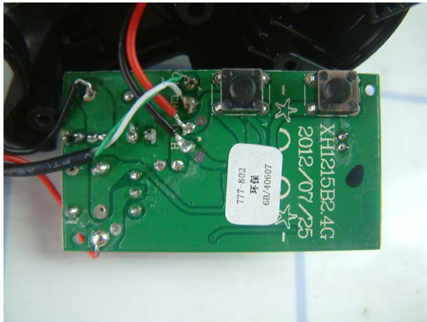
PCB view side 2