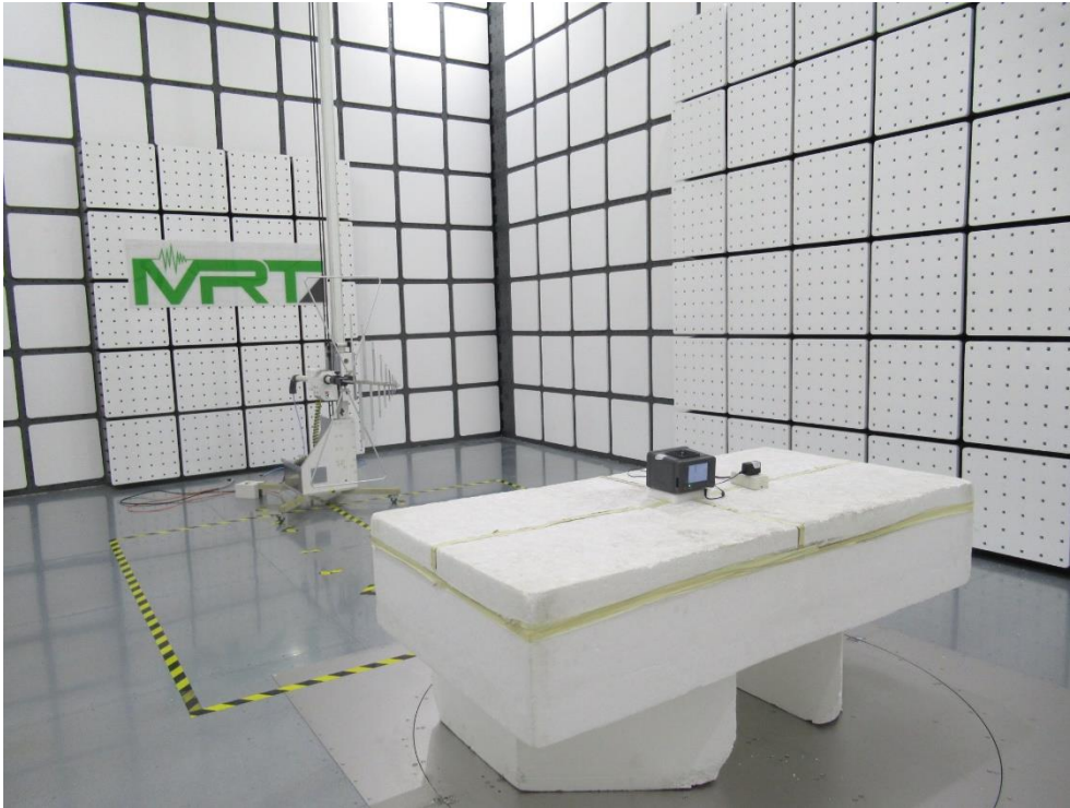
Description: Radiated Emission Test Setup for above 1GHz