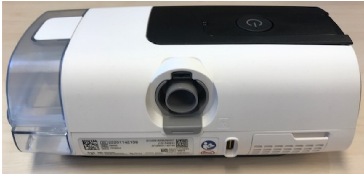
REAR VIEW OF DEVICE