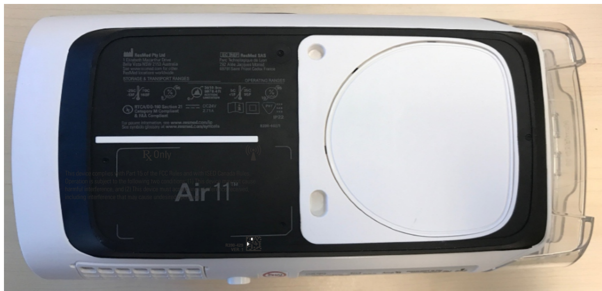
BOTTOM VIEW OF DEVICE