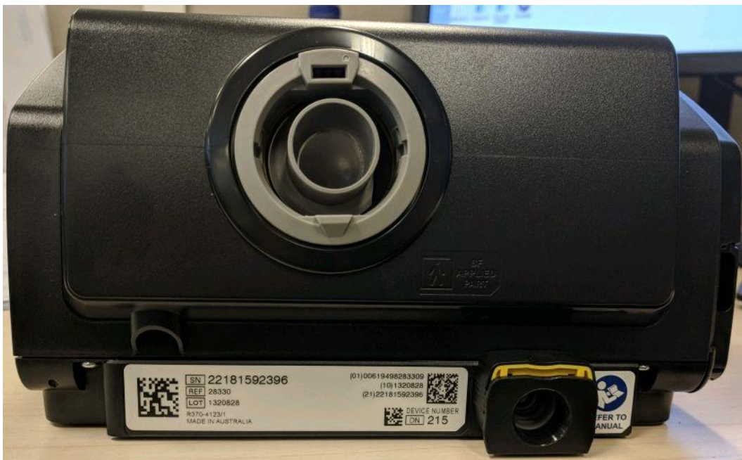
Bottom of Device