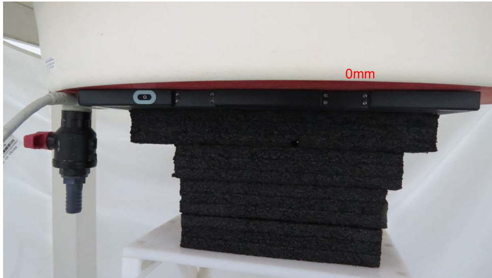
Picture 1: Back Side, the distance from EUT to the bottom of the Phantom is 0mm