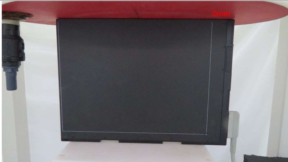
Picture 5: Top Edge, the distance from EUT to the bottom of the Phantom is 0mm