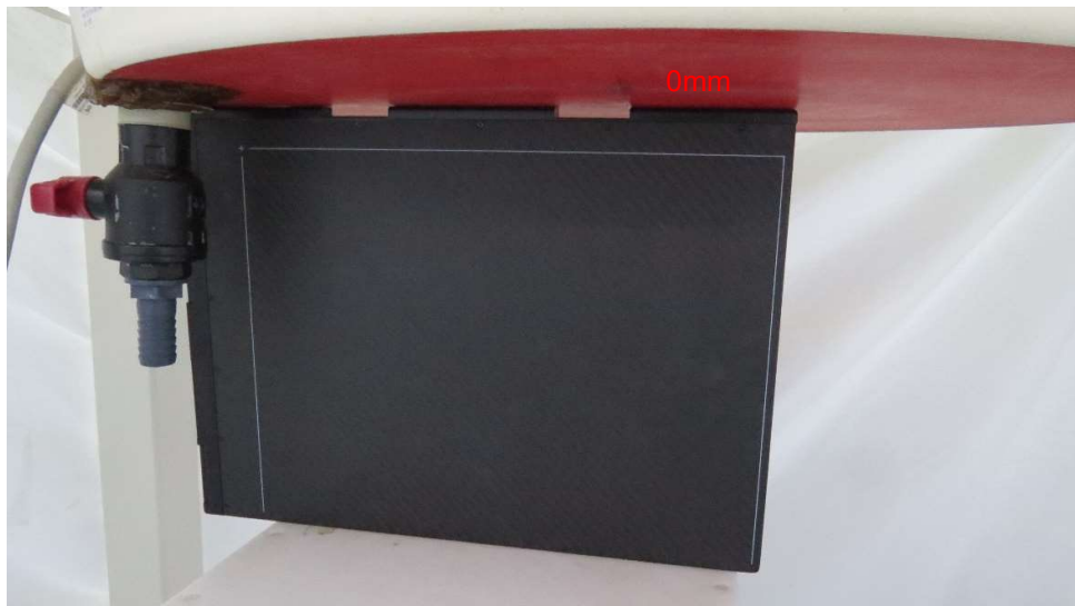
Picture 6: Bottom Edge, the distance from EUT to the bottom of the Phantom is 0mm