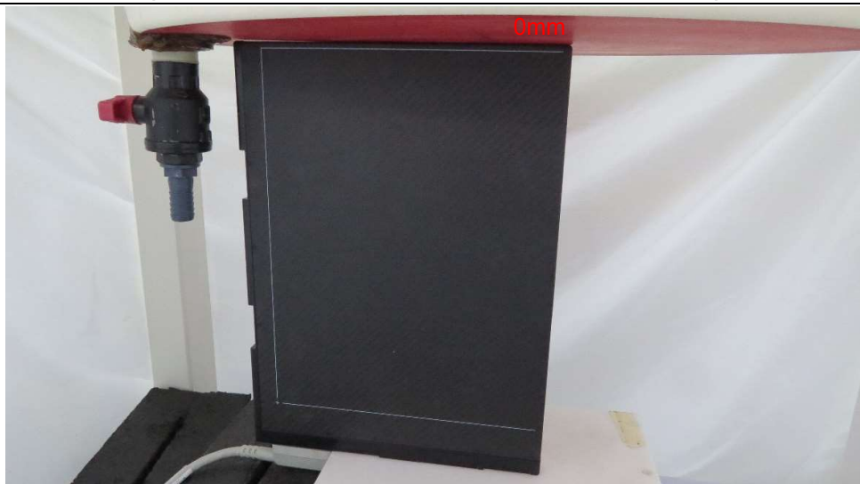
Picture 3: Left Edge, the distance from EUT to the bottom of the Phantom is 0mm