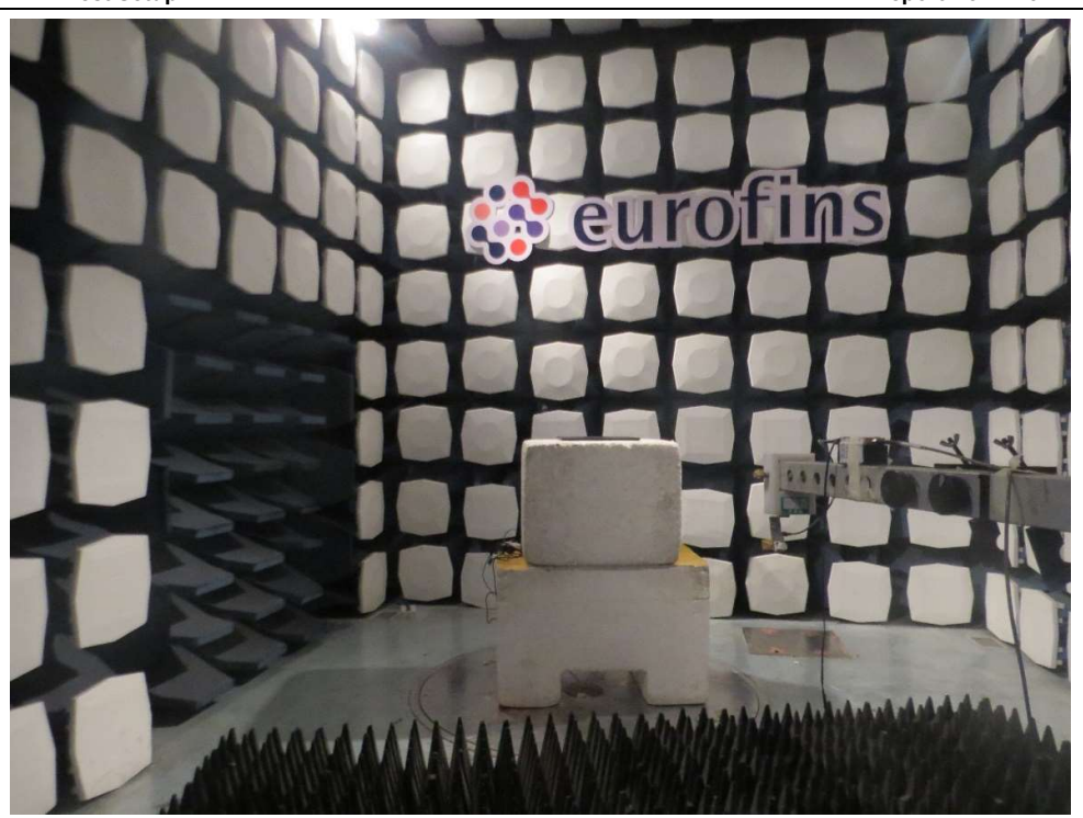
26.5GHz - 40GHz Picture 1 Radiated Emission Test Setup