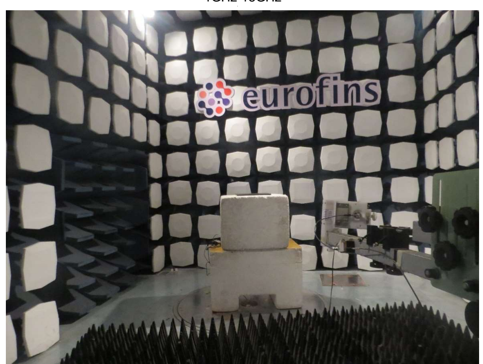
18GHz - 26.5GHz