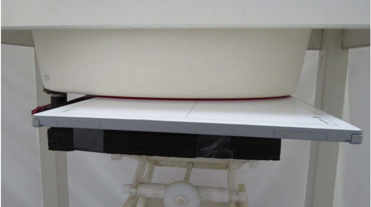
Picture 3: Front Side, the distance from handset to the bottom of the Phantom is 0mm (Scan 3)