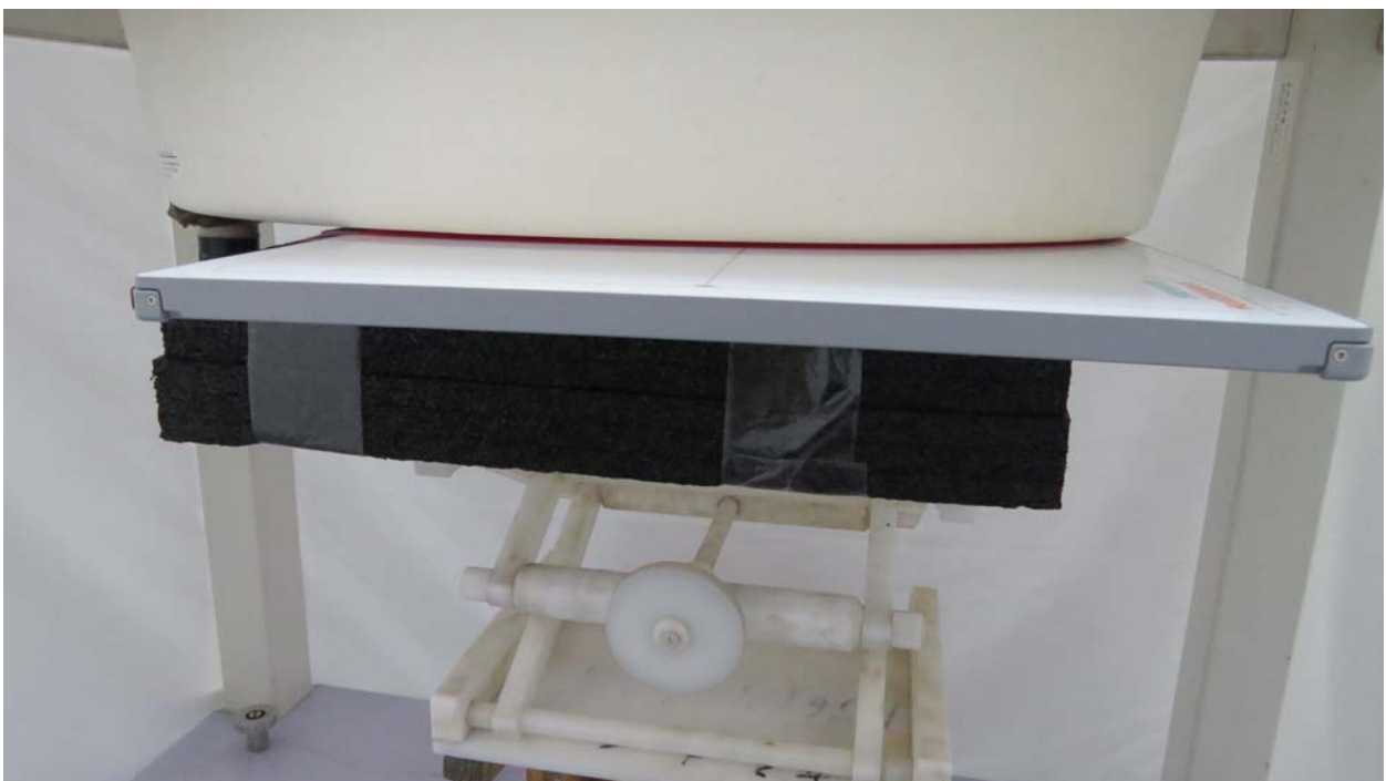
Picture 2: Front Side, the distance from handset to the bottom of the Phantom is 0mm (Scan 2)