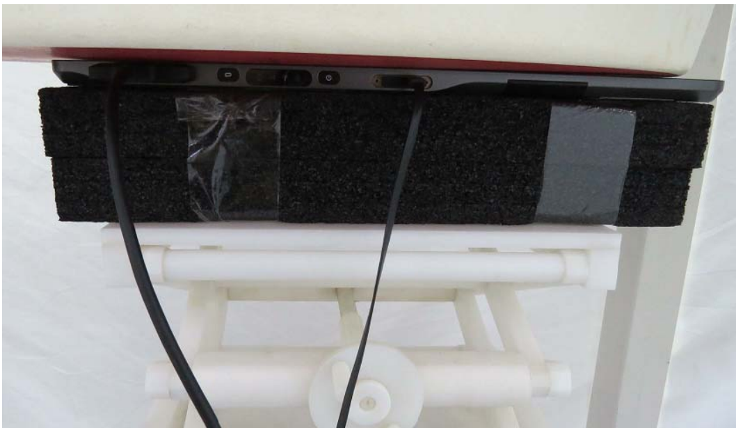
Picture 2: Front Side, the distance from handset to the bottom of the Phantom is 0mm (Scan 2)