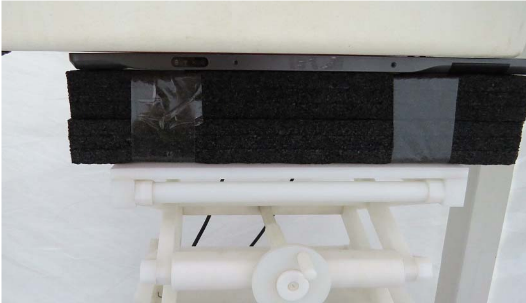
Picture 3: Front Side, the distance from handset to the bottom of the Phantom is 0mm (Scan 3)