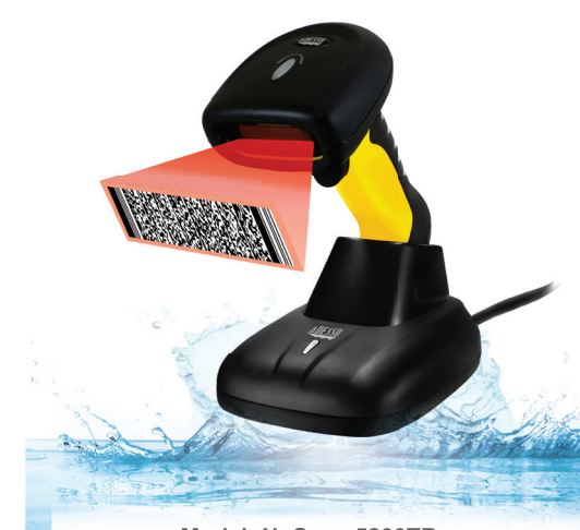
Model: NuScan 5200TR