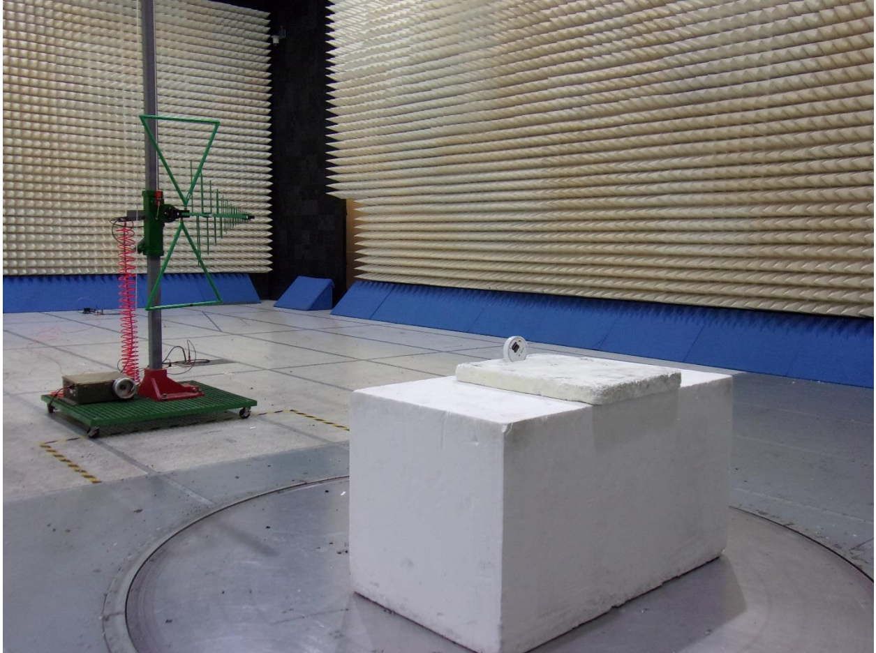
Radiated Emissions 30MHz – 1GHz