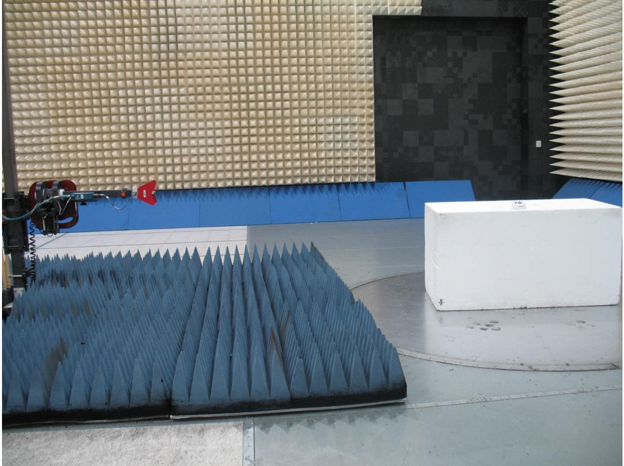
Radiated Emissions Above 1GHz (Transmitter Idle)