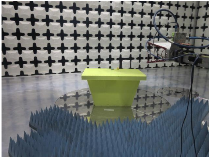
Part 15C and 15E