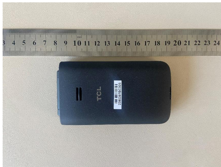
Pic 2 Mobile Phone(back)