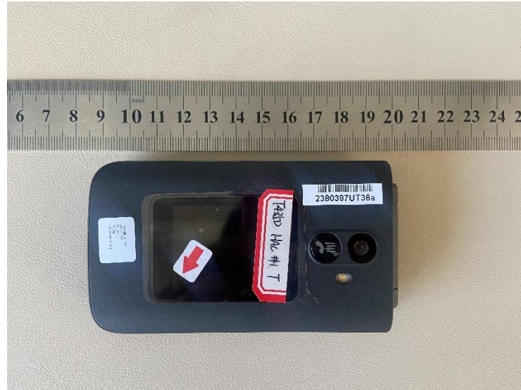
Pic 1 Mobile Phone(top)