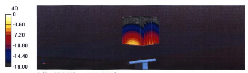
0 dB = 22.2 W/kg = 13.47 dBW/kg

Ratio of SAR at M2 to SAR at M1 = 50.6% Maximum value of SAR (measured) = 22.2 W/kg